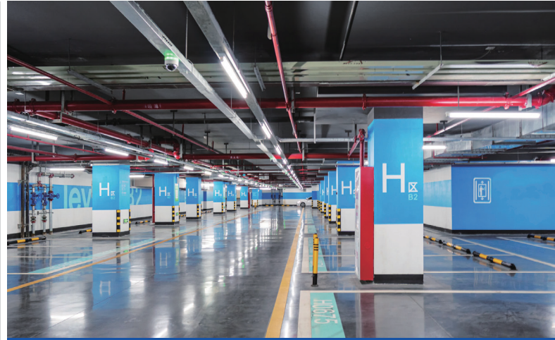
LED Waterproof UQ2